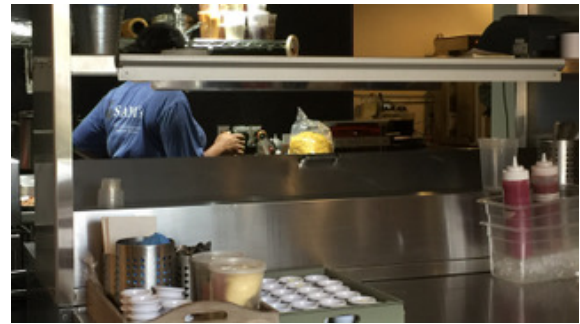
New kitchen with pass through window